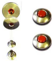
YKK FlexFix System